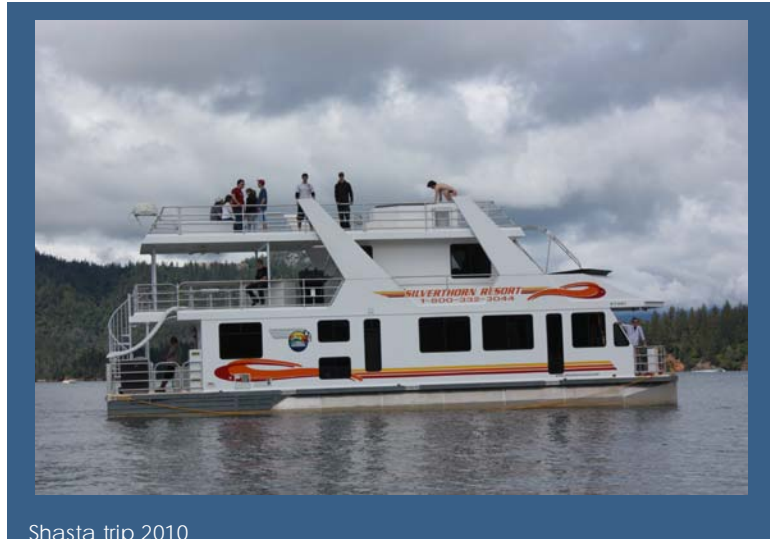
Shasta trip 2010

Winter brings snow and so we take advantage to MLK weekend to head to Sunriver with friends from the other Christian co-ops at OSU. We hit the slopes of Mt. Bachelor in skis and snowboards all day long. You'd think that would tire some people out but not this group. They come back to one of the three houses we rent to play games like Settlers of Catan and share in stories that leave us all laughing. This weekend gives us time to catch up with our Christian brothers and sisters. We encourage and pray for one another in our missions of being God's light on the OSU and LBCC campuses. It's a great reminder that we are not alone in Christ, that we always have someone to lean on.