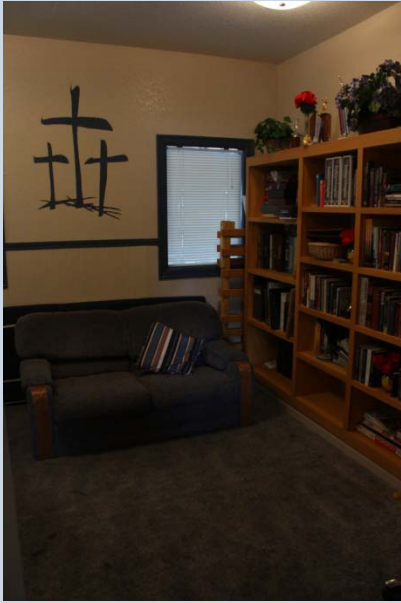
The Varsity House chapel